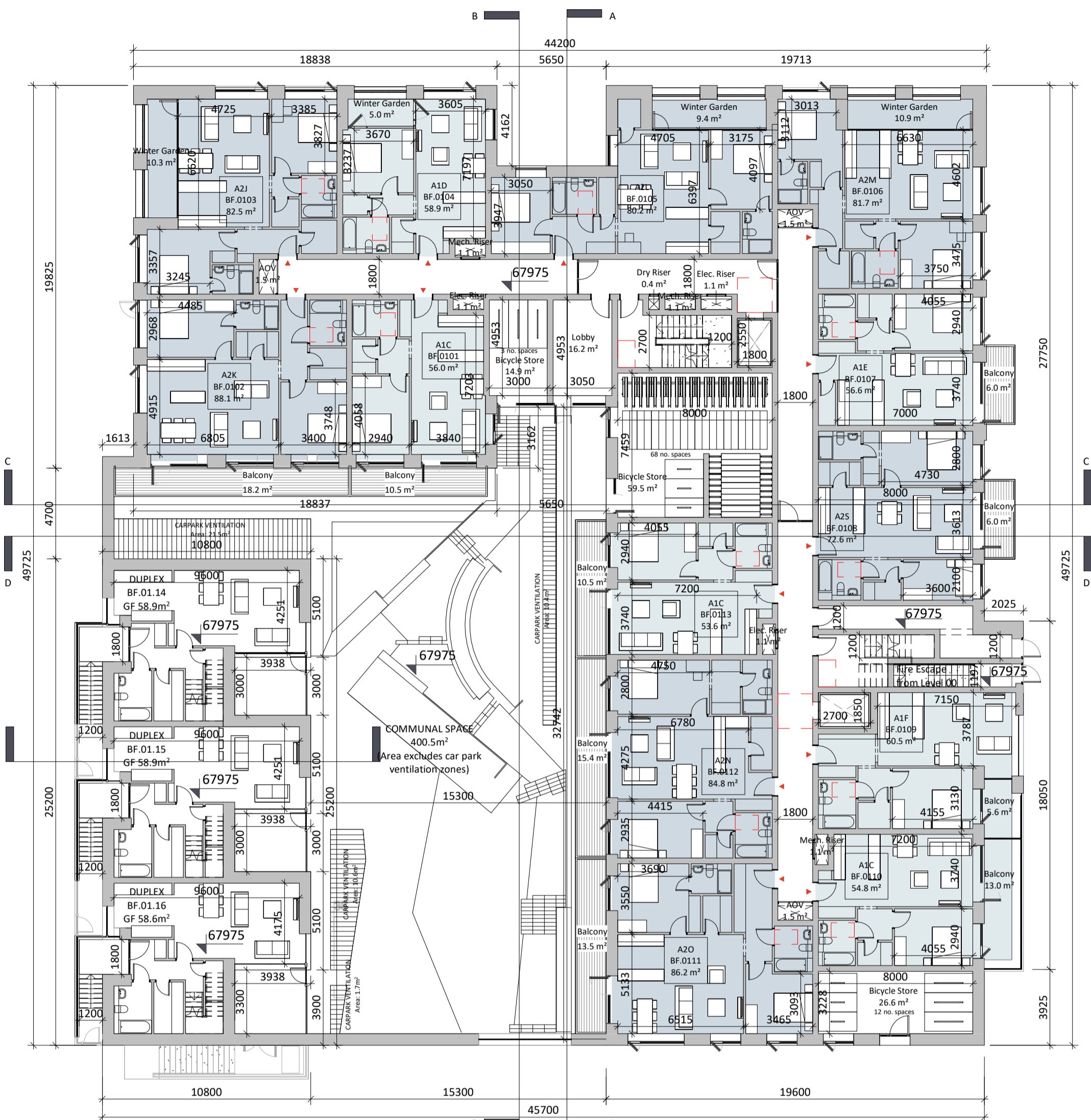
2 Block F Level 01 1:200