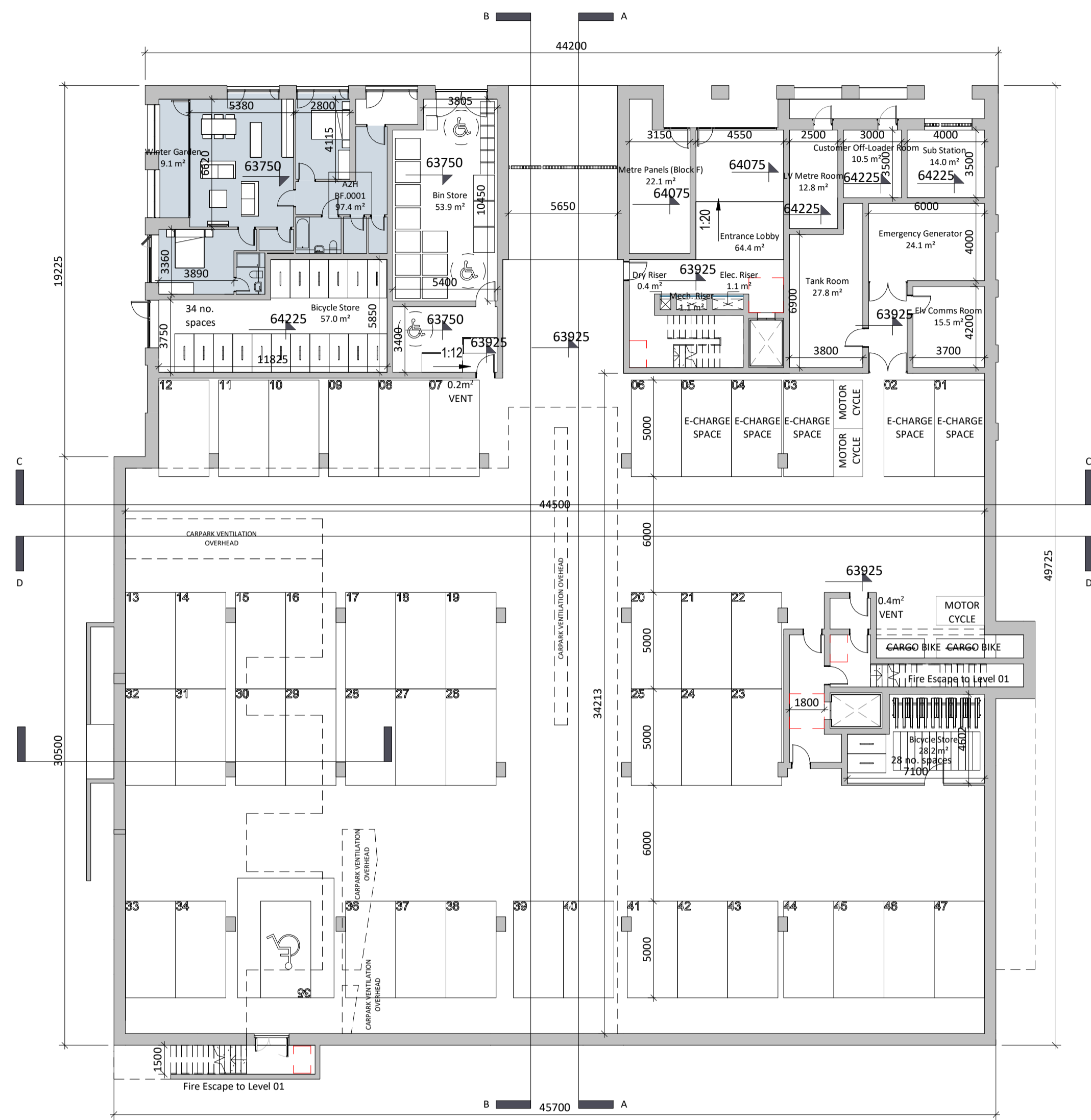
1 Block F Level 00 1:200